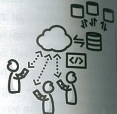
scaled product on scaled system, integrations