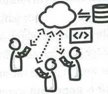
prototype/ pilot/beta on actual production systems