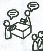
rehearsal using cardboard prototypes