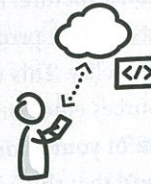
functional prototype/ proof of concept using throwaway code in prototyping environment